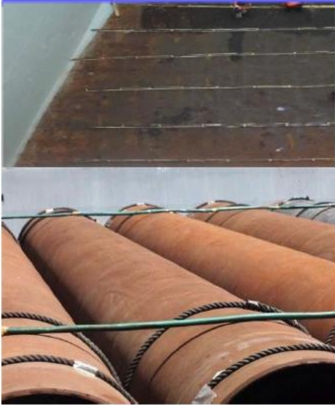
Picture of Dunnage Lines on Tank Top & Lashing Wires per Stack