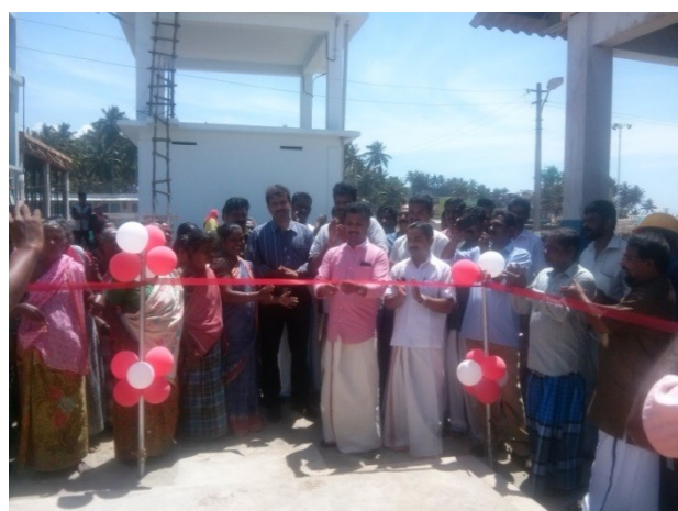
Fig 2: Public Sanitation Facility renovated at Vizhinjam Market and inaugurated by the Hon' Mayor in the month of Oct 2016.