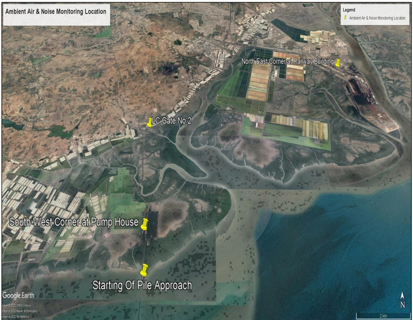
FIGURE NO. 1 GOOGLE EARTH IMAGE OF AMBIENT AIR QUALITY MONITORING & NOISE QUALITY MONITORING LOCATION