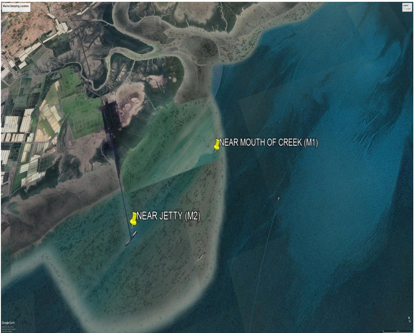
FIGURE NO. 2 GOOGLE EARTH IMAGE OF SEA WATER AND SEDIMENT LOCATION