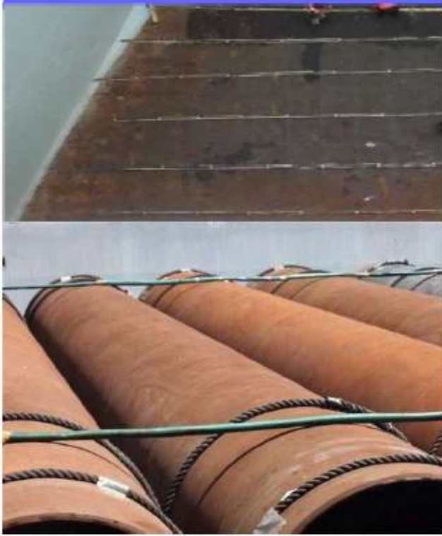
Picture of Dunnage Lines on Tank Top & Lashing Wires per Stack